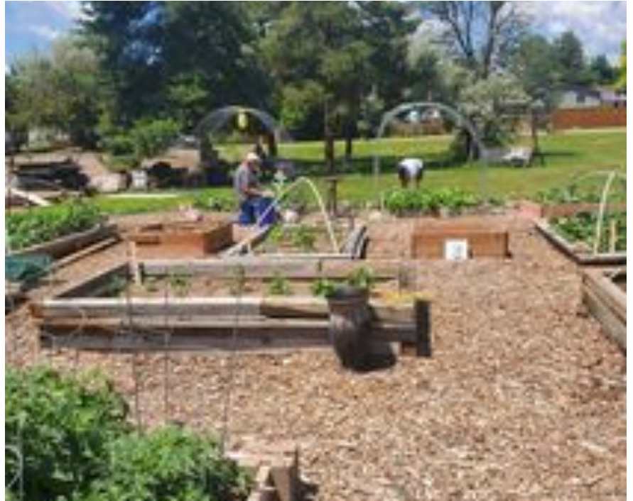
The current garden, 2024.

...and so much more that will be built upon each year, with your help. Stay tuned and find out more with your monthly subscription!